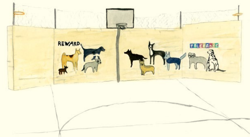
Horrie Long Reserve Dog Mural 2015, watercolour on paper, 13 x 19 cm

With sponsorship from BHP Billiton and other private companies, FORM, an arts organisation that focuses on community development through the arts, has commissioned over seventy public murals over two years as part of its PUBLIC festival. The project has been met with mixed responses; some praising the project for brightening the cityscape and engaging a wide range of people, others criticising much of the artwork for a lack of sensitivity to site, and the project overall as a band-aid fix for broader problems of city design. In other news, my favourite mural in Perth is this bad boy: