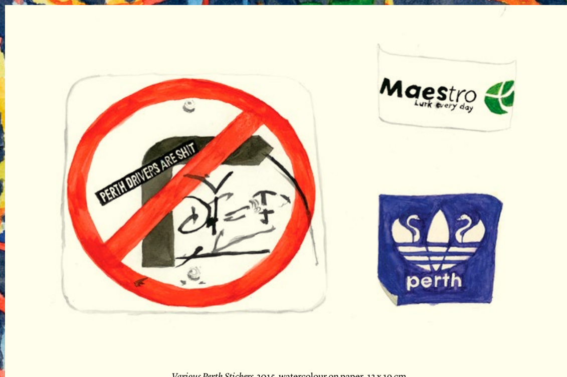
Various Perth Stickers 2015, watercolour on paper, 13 x 19 cm