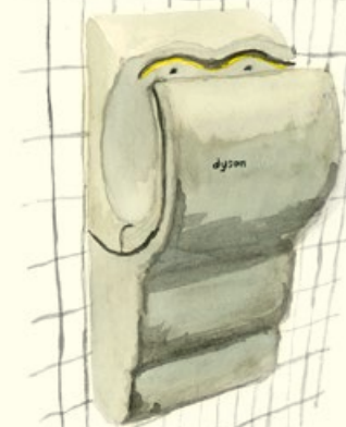
Worst/Best 2015, watercolour on paper, 13 x 19 cm